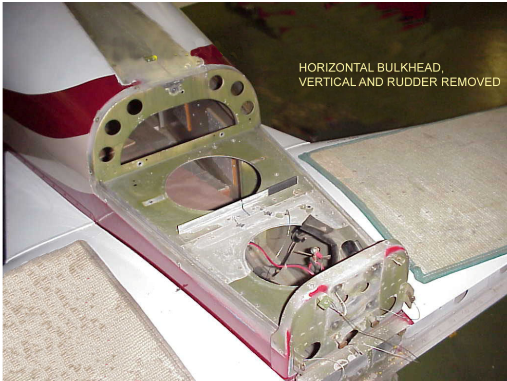
FIGURE 2 Vertical Stabilizer Removed